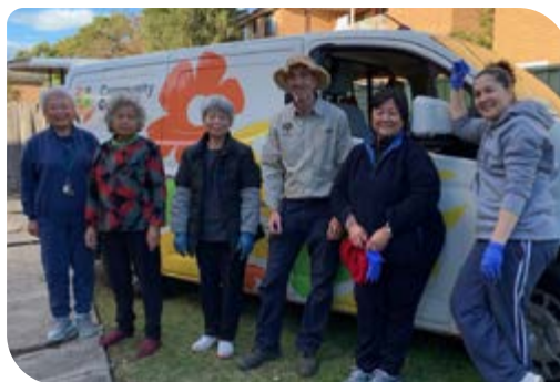
Under the new repairs & maintenance contract more tenants can set up community gardens

(Please note there is no change to arrangements for Leasehold properties or to existing cleaning and grounds maintenance in most cases)