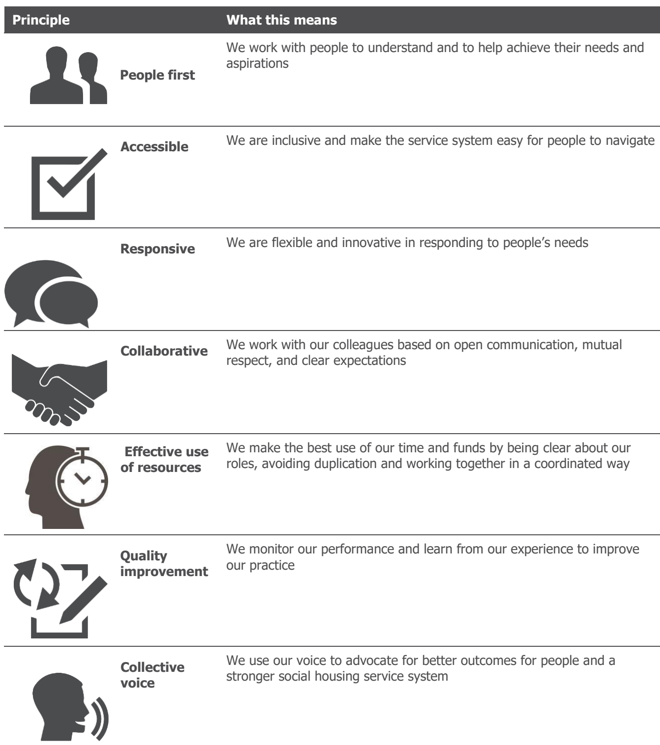
Table 1 Guiding principles

Our approach to coordinating the social housing service system in Northern Sydney will be guided by the following principles: